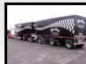
LEAD & PUP