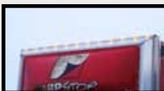
BULKHEAD LIGHT BAR