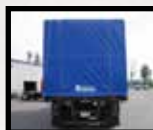
ROPE & PULLEY